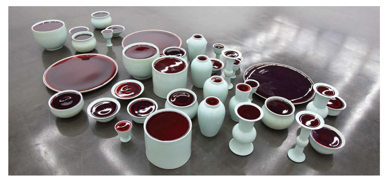
Container Series, Liu Jianhua, Porcelain