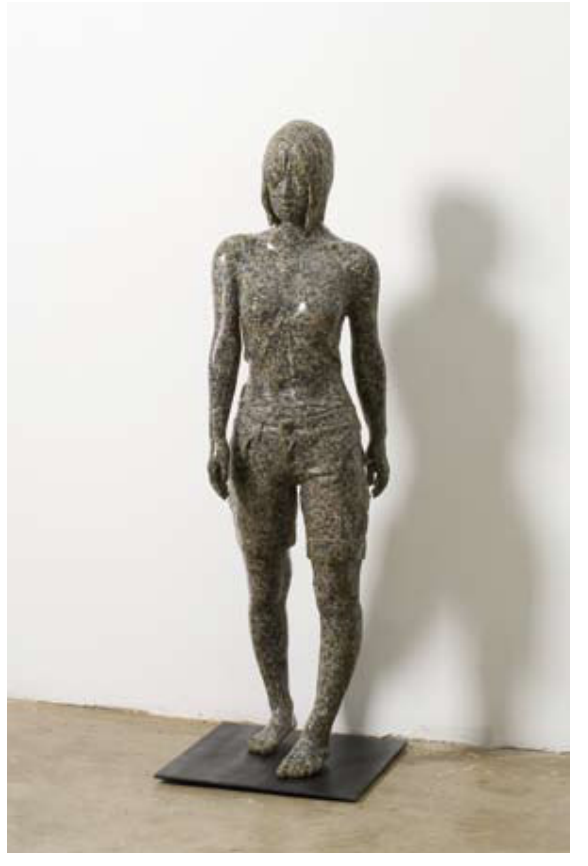
Shredded Paper Man & Shredded Paper Girl, Yang Qian, Mixed Media Sculptures