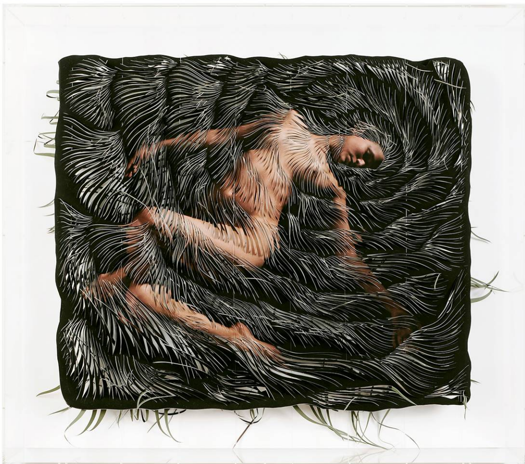
Georgia Russell, Marie Cerise , 78.5 x 89 x 14 cm, Mixed Media