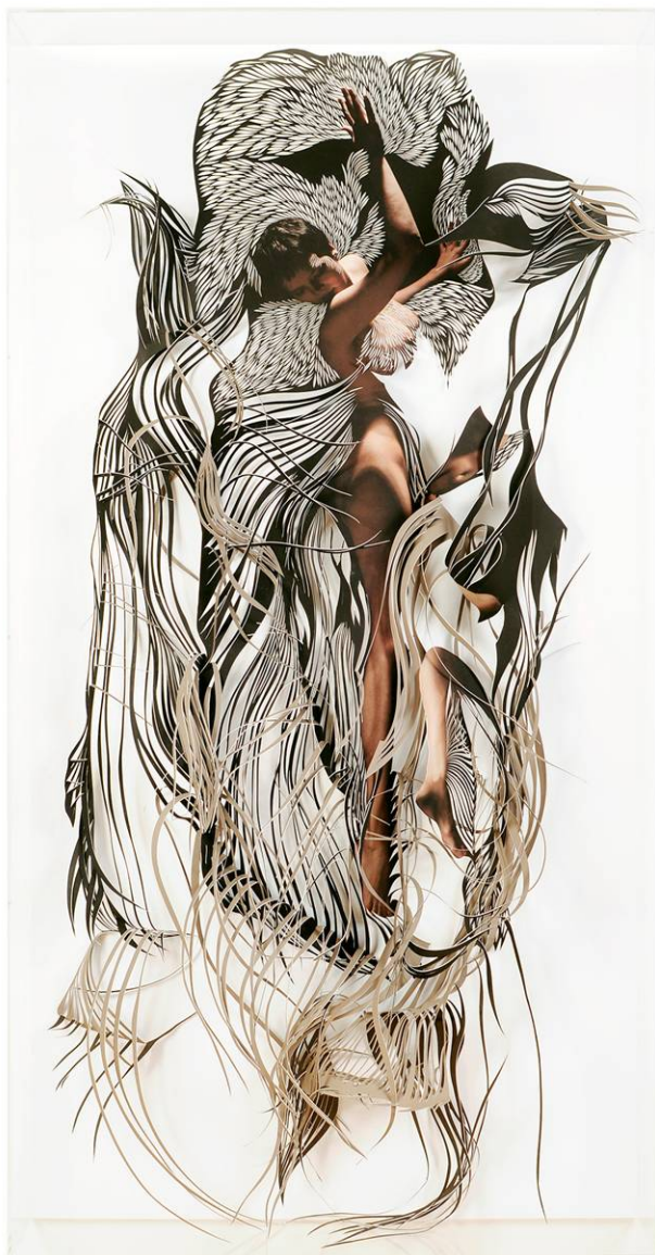
Left, Georgia Russell, MC1/Marie Cerise , 200 x 105 x 17 cm, Mixed Media