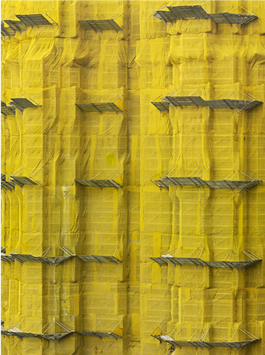
Yellow Cocoon #7, Hong Kong, 2011

Herein began Peter's fascination with these multicoloured structures, standing out like giant wrapped packages in the midst of the neutral, almost monochromatic surroundings skyline. The scale and size of them was something that struck him the most and with their cranes and flood lights mixed in with the ambient city lights, they eerily took on a sci-fi look and feel to them. This is when he started to first make images of the structures as he was travelling with his trusty companion, a large format 4x5 camera using sheet film.