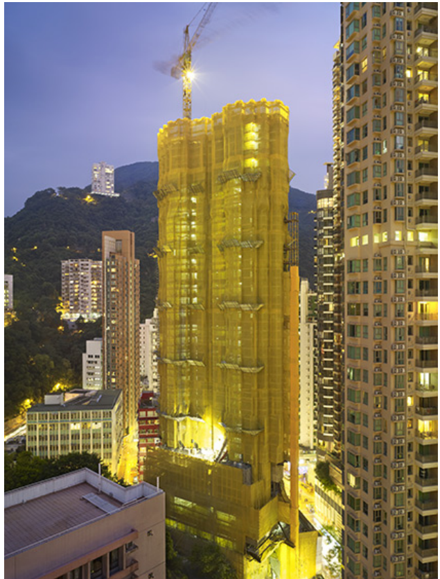
Wanchai Yellow Cocoon, Hong Kong, 2011.