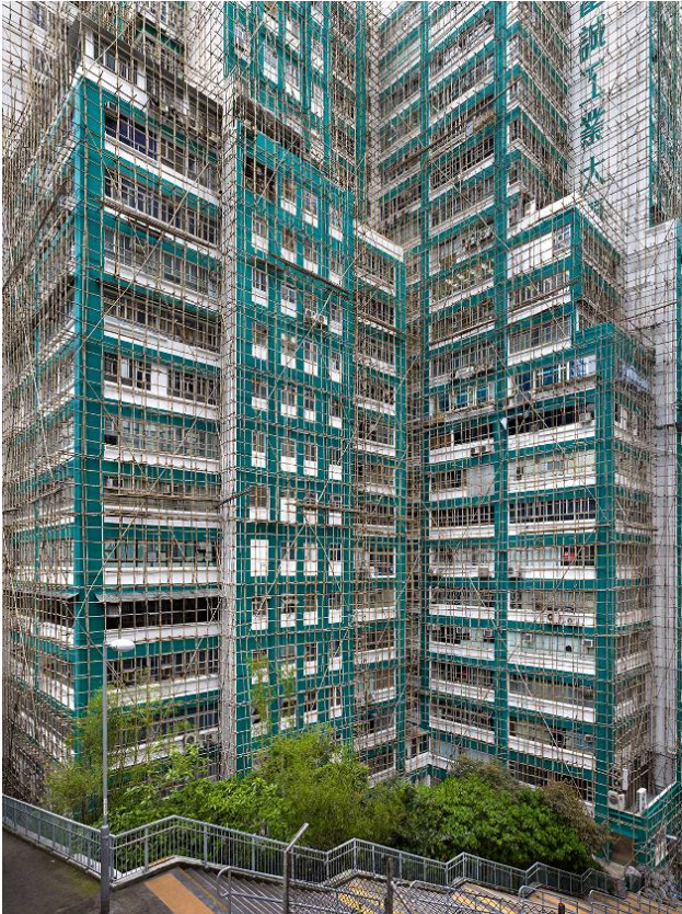
Aqua Cocoon Cage, Hong Kong, 2012.