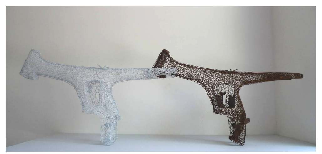
Shi Jindian, Two Birds , Painted Stainless Steel Wire, Metal, 62 H x 186 W x 25 D cm each, 2011

Shi Jindian was born in 1953 in China's Yunnan Province. He studied at the Sichuan Fine Arts Institute and currently lives and works in Chengdu. Shi Jindian's works can be found in the collections of prominent museums and organisations including The Montpellier Contemporary Chinese Art Biennale, France; Seoul Art Museum, Korea and The White Rabbit Contemporary Chinese Art Collection, Australia.