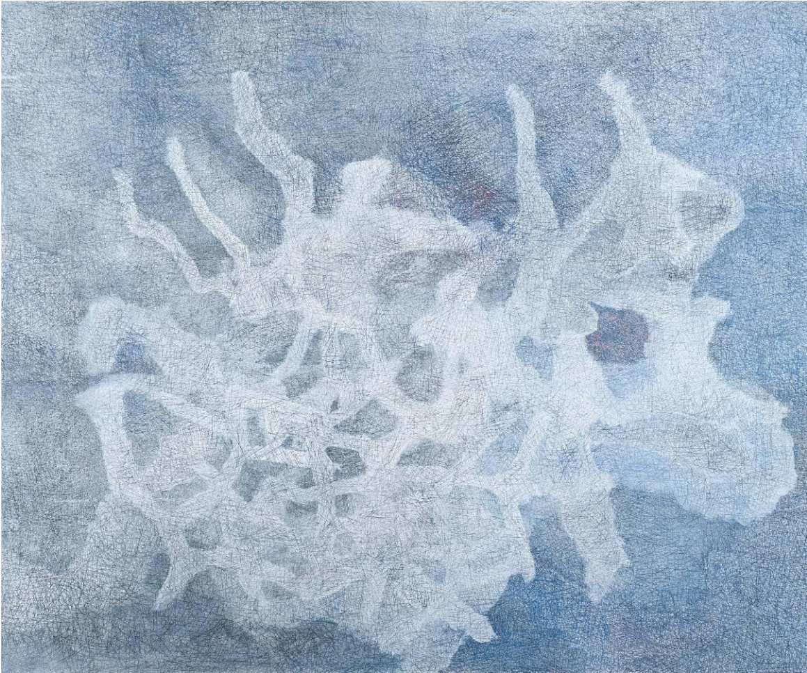
Shi Jindian, Acrylic on Canvas, 100 x 120 cm, 2008