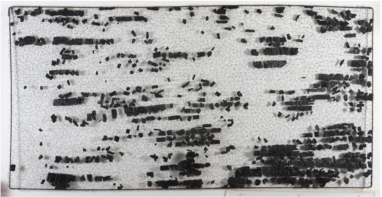
Shi Jindian, Stainless Steel Wire, Charcoal, 120 x 200 x 5 cm, 2013