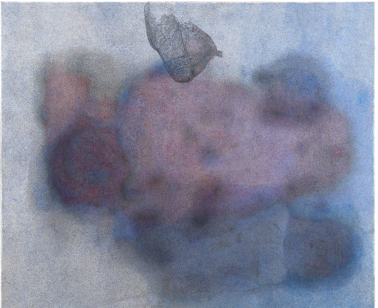
Shi Jindian, Acrylic on Canvas, 100 x 120 cm, 2005