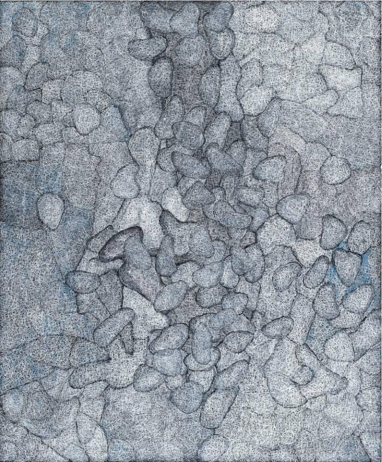
Shi Jindian, Acrylic on Canvas, 120 x 100 cm, 2011