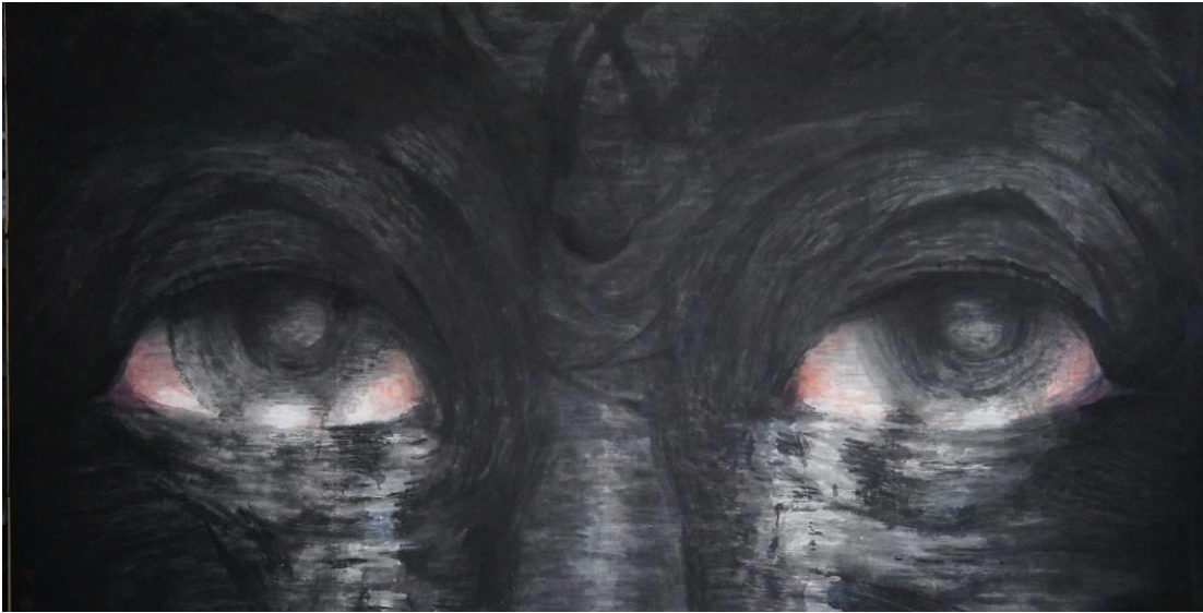
Wong Hau Kwei, Survivor , 190 x 97 cm, Ink & Colour on Paper