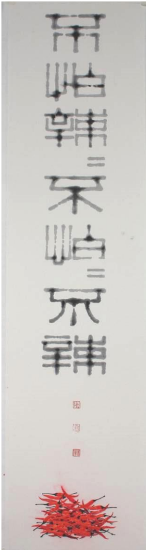
Wong Hau Kwei, Trilogy of Spiciness 不怕辣辣不怕怕不辣, 138 x 33 cm, Ink & Colour on Paper