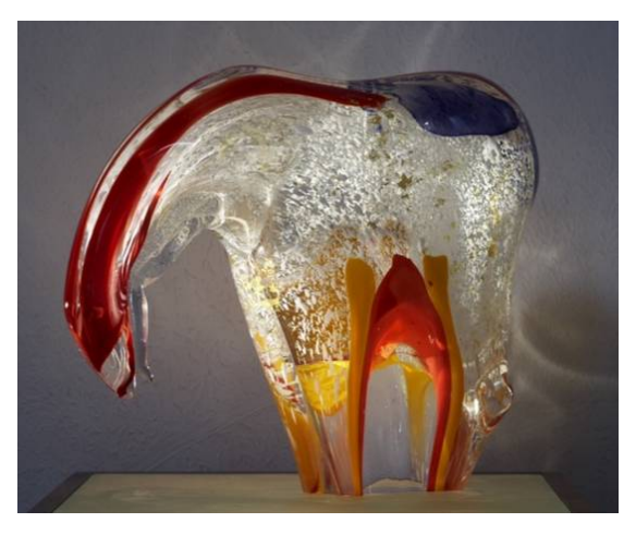
Shan Shan Sheng, Tang Dynasty Horse, 46 x 33 x 13cm, 2013, Venetian Hand Blown Glass