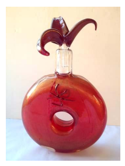
Shan Shan Sheng, Sun Flower, 65 x 40 x 10 cm, Venetian Hand Blown Glass