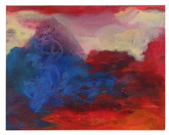
Shan Shan Sheng, Calligraphy in Landscape, 122 \times 152 cm, Oil and mixed media, 2005