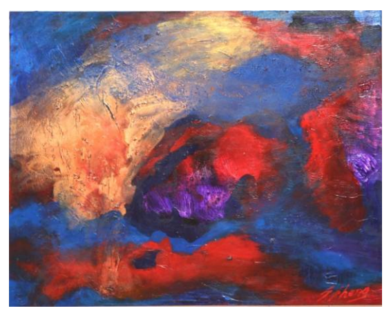
Shan Shan Sheng, Blue Memories of Venice, 122 \times 152 cm, Oil and mixed media, 2005