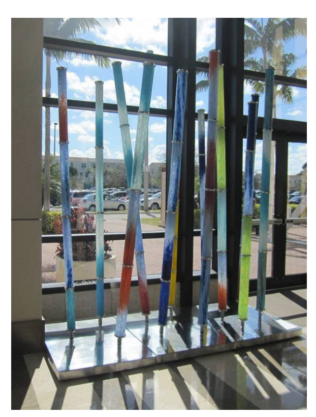
Shan Shan Sheng, Bamboo Ever-Rising, Dimensions variable, Venetian Hand blown glass, stainless steel