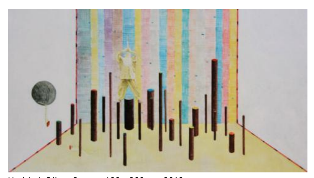
Untitled, Oil on Canvas, 100 x 200 cm. 2012