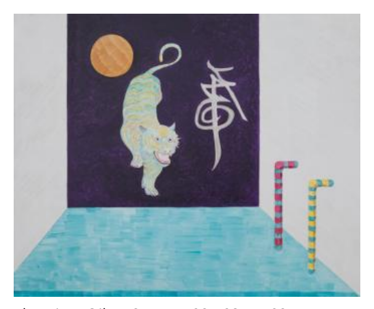
Blue Tiger, Oil on Canvas, 120 \times 98 \text{ cm} , 2014