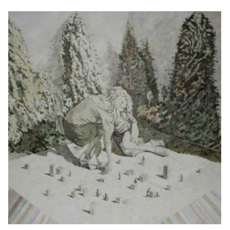
Rationalist, Oil on Canvas, 200 x 200 cm, 2012