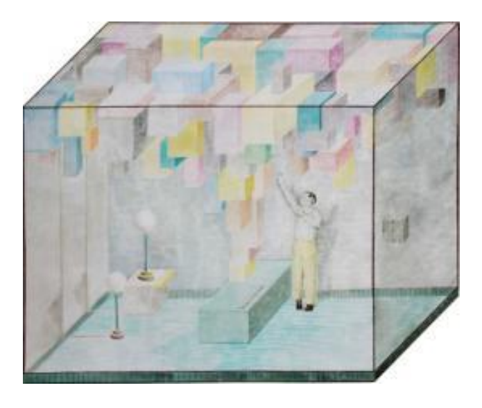
Untitled, Oil on Canvas, 150 x 180 cm, 2012