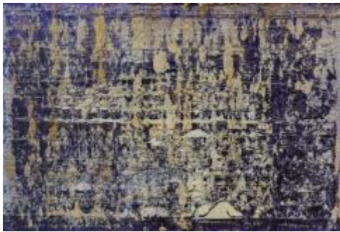
Wong Perngfey, Silhouette , Oil and Enamel on Linen, 135 x 200 cm