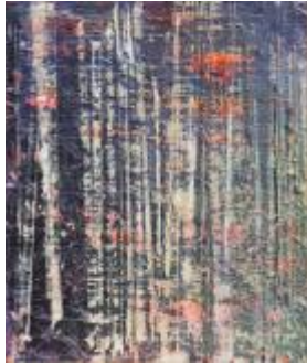
Wong Perngfey, Hei Qiao Woods , Oil and Enamel on Linen, 180 x 150 cm, 2015