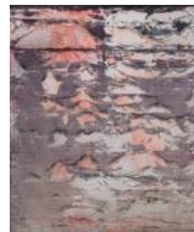
Wong Perngfey, Traces of Time II , Oil and Spray Paint on Linen, 155 x 135 cm, 2015