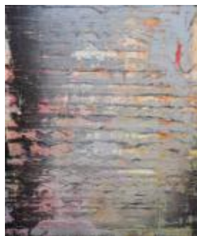
Wong Perngfey, Traces of Time , Oil and Spray Paint on Linen, 155 x 135 cm, 2015