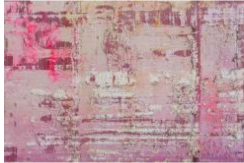
Wong Perngfey, Tonight the Light is Almost Sweet , Oil and Enamel on Linen, 135 x 200 cm, 2015