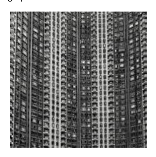
One Thousand Flats, Hong Kong – 2013, Photograph