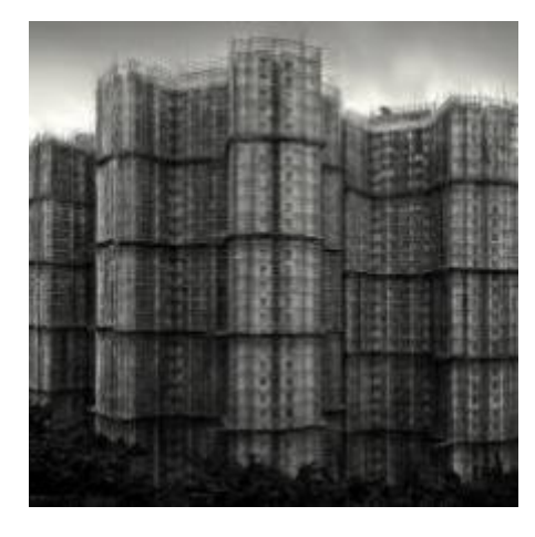
Chai Wan Cocoon, Hong Kong – 2009, Photograph