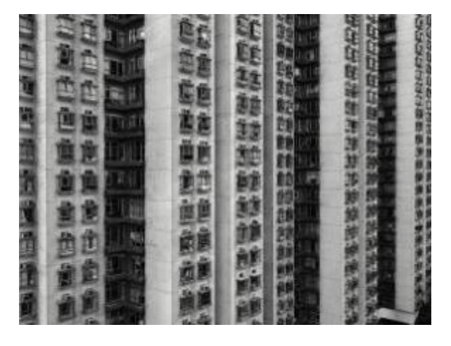
West Island Flats, Hong Kong – 2010, Photograph