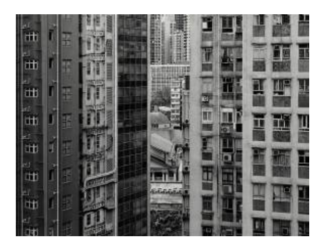
Adoremus, Hong Kong – 2015, Photograph