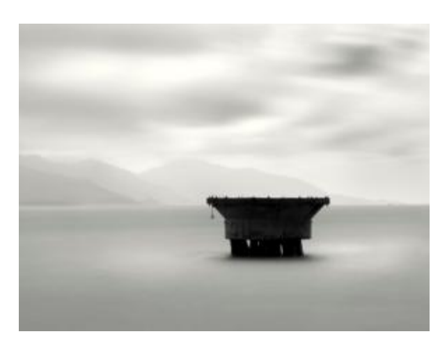
Black Moor, Hong Kong – 2007, Photograph