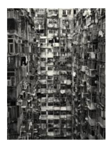
Taikoo Windows, Hong Kong – 2008, Photograph