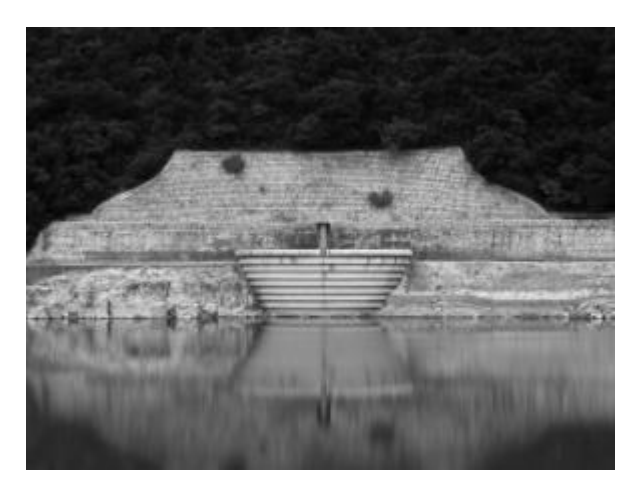
Wall of Shing Mun, Hong Kong – 2015, Photograph