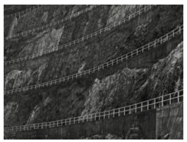
Terraced Rock Wall, Hong Kong – 2015, Photograph