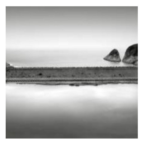
High Island Reservoir Dam, Hong Kong – 2008, Photograph