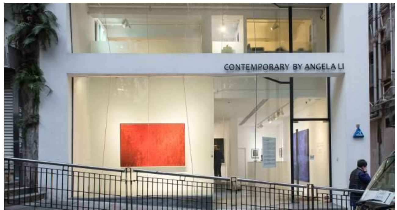
Gallery Exterior, Contemporary by Angela Li