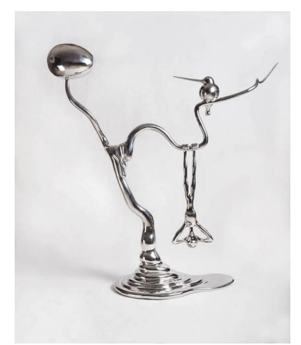
Chen Wenling, Memory Tree No.3, Stainless Steel, 122H x 120L x 40W cm