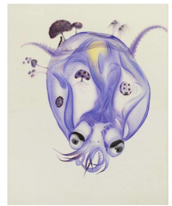
Cang Xin, Hidden Consciousness Series X - #059, Pigment on silk, 120 x 80cm