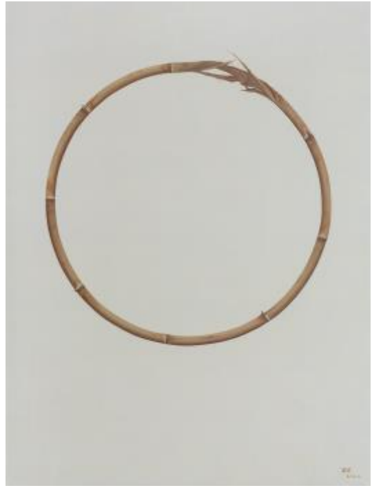
Wu Didi, Seems Perfect, oil on canvas, 180 x 135 cm