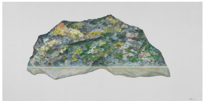
Time Difference , Oil on canvas, 120 x 240 cm