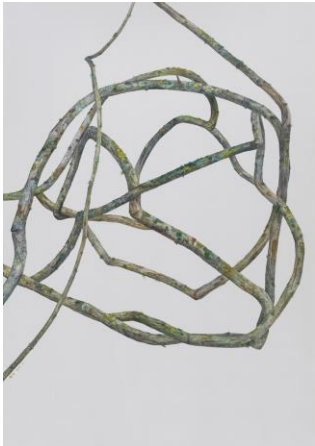
Not Quite Empty , Oil on canvas, 200 x 140 cm