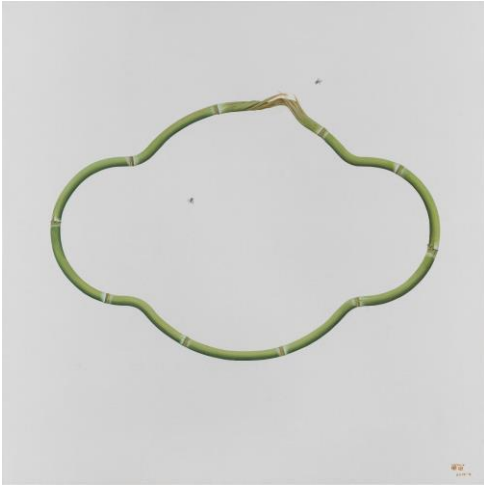
Still Life - Bamboo No.11 , oil on canvas, 120 x 120 cm