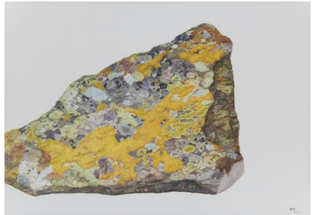
The Stillness of Nature , Oil on canvas, 150 x 200 cm