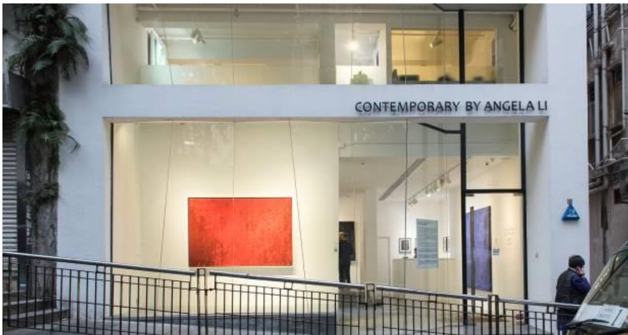
Gallery Exterior, Contemporary by Angela Li