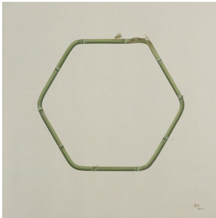
Still Life - Bamboo No. 10 , Oil on canvas, 120 x 120cm

[Hong Kong, October 2016] Contemporary by Angela Li is proud to present “Precised Fictitiousness”, the first solo exhibition in Hong Kong of Beijing-based artist Wu Didi. The exhibition features 11 gongbi oil paintings from her Still Life – Bamboo series, Moss Rock series and No Weed series. With extra fine brushstrokes, Wu delicately describes the spirituality and immortality of nature’s simplest elements. Wu completed her postgraduate degree in oil painting at the Central Academy of Fine Art in 2004 and has been a lecturer at the Central Academy of Dramatic Art ever since.