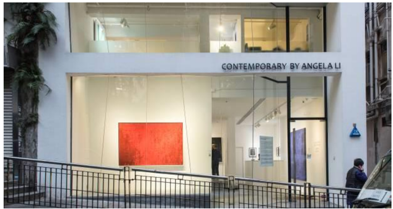
Gallery Exterior, Contemporary by Angela Li