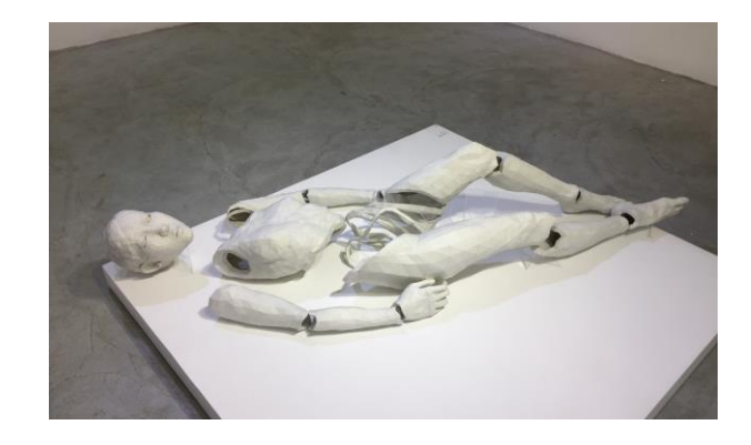
Ann Hoi Untitled, Paper Sculpture, H35 x W165 x D40 cm, 2016