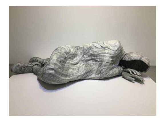
Ann Hoi Vagrant, Paper Sculpture, H45 x W130 x D40 cm, 2016