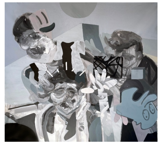
Elias Pena Salvador. The Match. Acrylic & Oil on Canvas, 135 x 143 cm, 2020

Having received a joint degree from the University of the Arts Berlin and China Academy of Arts Hangzhou, a strong German influence can be found in the works of Chinese contemporary artist Liang Manqi . Lingering between abstract and non-abstract, rational and irrational, Liang focuses on how space, media and colour convert their relationships between real and virtual contexts in polygonal dimensions. By creating a layered and spatial of emotion on flat canvases, she utilizes the combination of fragments of colours as an exploration of a new three-dimensional space. The continuous regrouping of colours strikes a harmonious balance between the image and the space. Her latest works featured in this exhibition further enrich the dynamics of geometry and invite viewers to plunge into her parallel world.