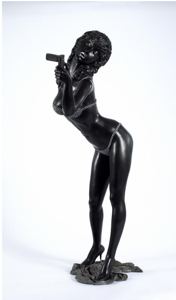
1/100 Second , Peng Di, Bronze, 112 x 70 x 40 cm