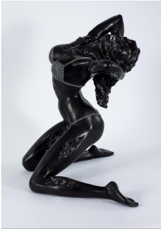
Morning , Peng Di, Bronze, 77 x 76 x 56 cm